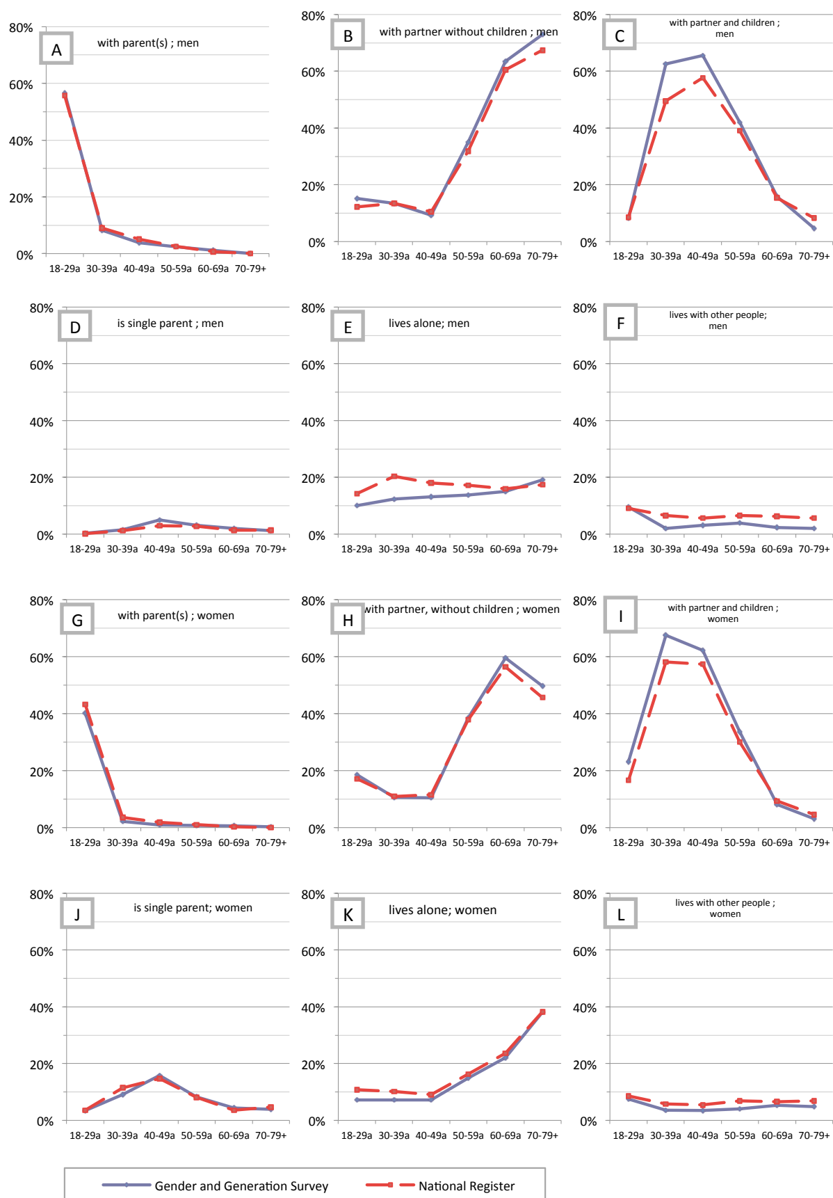
Figure 1 : Household position of men and women, by age group, Belgium. Comparison of the GGS data with the National Register.